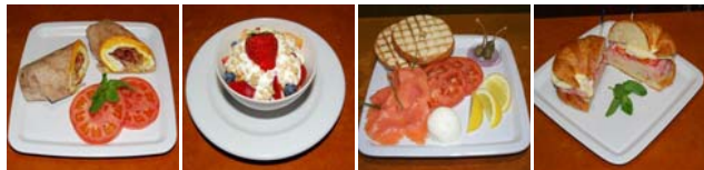
Blue Jean Wrap

Cream cheese (regular or low fat) Cinnamon and sugar | Peanut butter and jelly